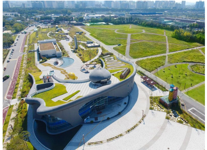
The Jungnang Wastewater Recovery Facility in Seoul, South Korea, was able to decrease its footprint with the Proteus technology and convert former treatment space to parkland.

Tomorrow Water applied for the Pilot Program in spring 2021 and was accepted for a pilot at MMSD’s South Shore facility. The pilot operated in late 2021 and early 2022 with successful results.