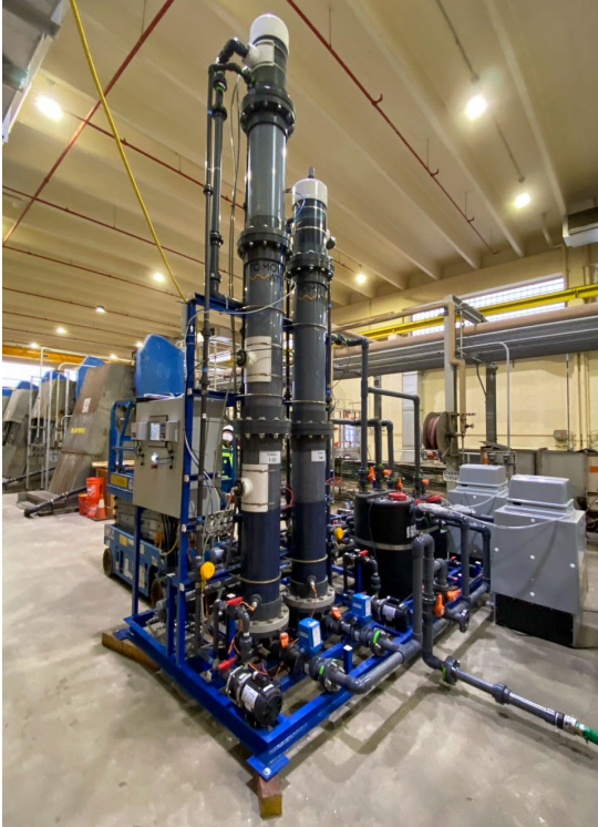
MMSD tested the Proteus pilot at its South Shore facility in 2021-22.